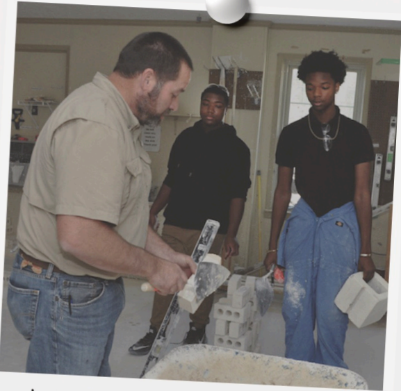
NORTH CAROLINA MASONRY CONTRACTORS ASSOCIATION Grant Recipient 2019-2022