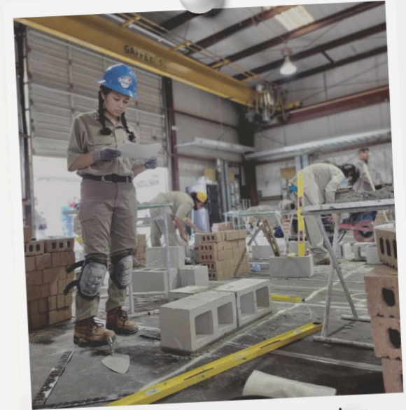
TEXAS MASONRY COUNCIL Grant Recipient 2021-2022

At full capacity, our Alliance Program's annual contribution will generate $105,000 in annual grant dollars given away that year. Effectively, it will double what the Foundation awards per year.